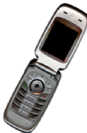
Fig. 2 Example of an unacceptable low-resolution image.

Equation can be put inside main body text without numbering (e.g., y = mx + c ).