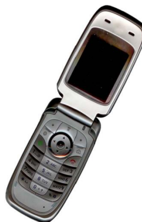
Fig. 3 Example of an image with acceptable resolution.